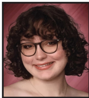
Cleonice Hamm Performing Arts Castle HS UH Manoa